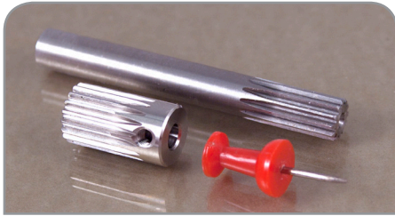
MATERIAL: Carbon Steel or Stainless Steel